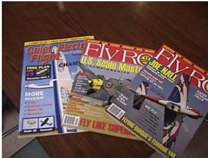
DSC Free Magazine Raffle February 2007